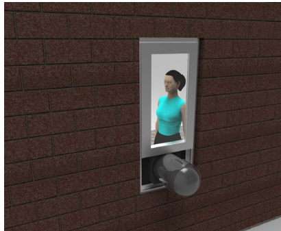
Uses solar radiation from south-facing window