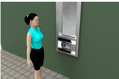
Easy-to-use window mounted solar oven

If we want non renewable energies to make real, large scale impact, they need to get integrated into modern lifestyle. For example, if we want the space-starved, time constrained urban dweller to adopt solar energy, it should be made as convenient for them as switching on their microwave ovens.